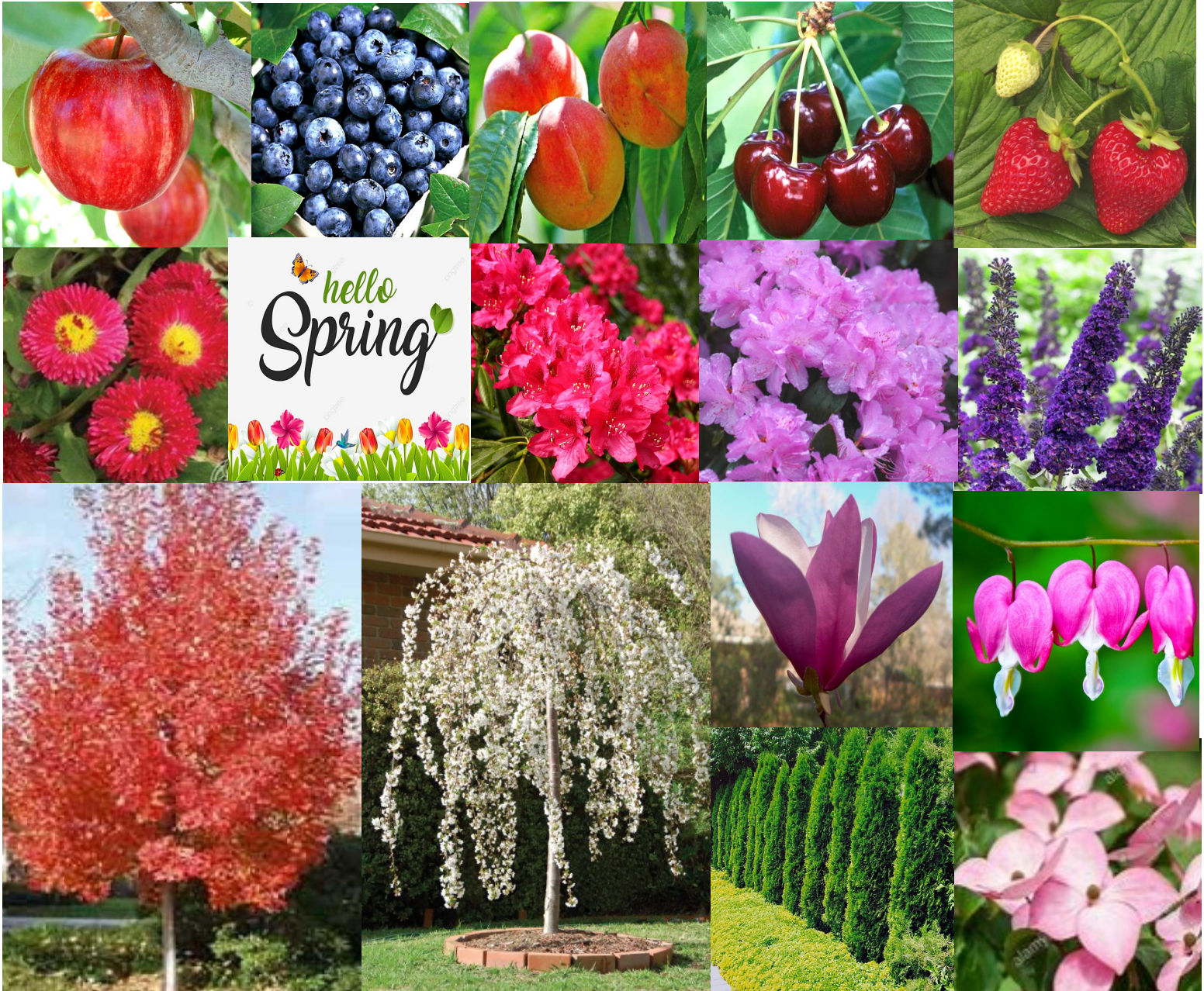
Great Selection of Shade and Flowering Trees!

Big selection of Fruit Trees, Shade and Flowering Trees, Perennials, Arborvitae and Leyland Cypress for Privacy Hedges, Flowering and Ornamental Shrubs - and MORE!